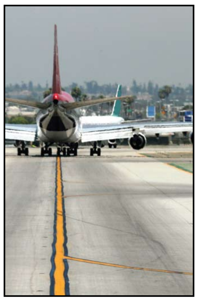
Federal Aviation Administration Air Traffic Organization Office of Runway Safety www.faa.gov/runwaysafety

A runway incursion is any occurrence at an aerodrome involving the incorrect presence of an aircraft, vehicle or person on the protected area of a surface designated for the landing and take off of aircraft